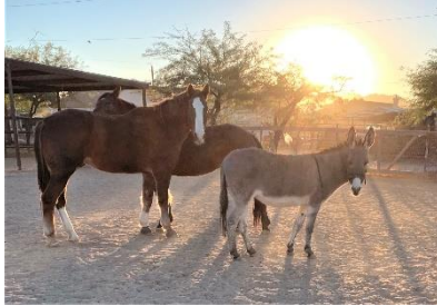
Ruby, Murphy and Violet in the glow of the sunset.

Of course, some of this could be attributed to the presence of the animals that are ubiquitous here. One horse has multiplied into 8 plus a donkey. There are 3 goats, 3 turkey hens, 2 ducks and the requisite chickens in addition to 6 dogs. The natural world and animals always remind me of the presence of the divine. It is the horses that bring me closer to the divine presence. I feel a kinship with them that I can't explain. When I am with them, I feel as if I am "with my people" accepted into the herd. Part of the tribe.